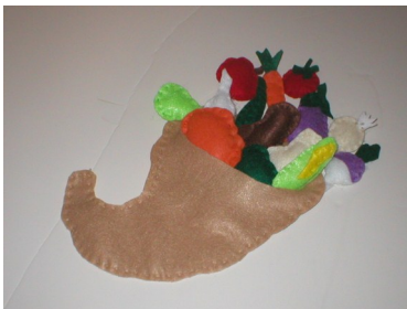
Cornucopia made in Pins & Needles Class